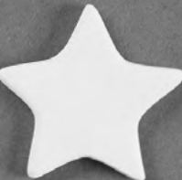
33445 Star Embellie 1.5" x 1.5" x .15" 12 per case