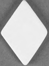
33441 Diamond Embellie 1.75" x 1.15" x .15" 12 per case