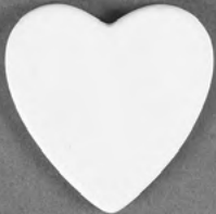
33442 Heart Embellie 1.45" x 1.5" x .15" 12 per case