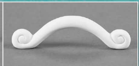
33447 Fanciful Handle Embellie 4.5" x .5" x 1.25" 12 per case Shown on 31816 Jewelry Box