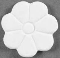
33443 Flower Embellie 1.25" x 1.25" x .15" 12 per case