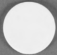
33444 Circle Embellie 1.45" x 1.45" x .15" 12 per case