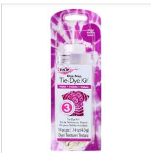
Tulip® One-Step Tie-Dye Kit® Violet (31681)