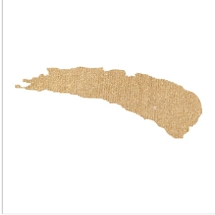
Gold 1 oz. (15808)