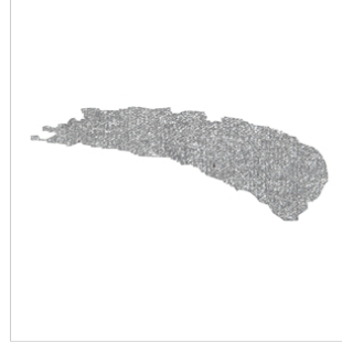
Platinum 1 oz. (15806)