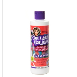
Collage Pauge® Instant Decoupage™ Glossy 8 oz. (25086)