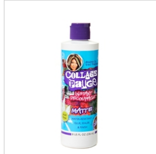
Collage Pauge® Instant Decoupage™ Matte 8 oz. (25083)