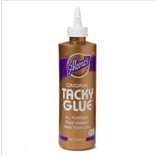
Aleene's® Original Tacky Glue® 8 oz. (15599)