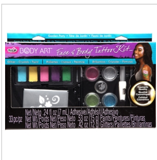
Tulip® Body Art® Kit Garden Party (32546)