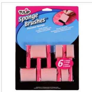
Tulip® Sponge Brushes™