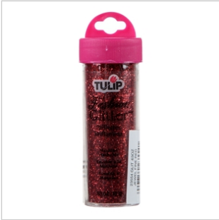
Red Fine Jewel (23554)