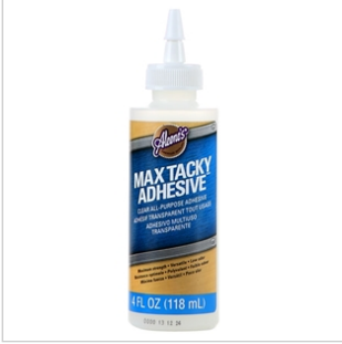
Aleene's® Max Tacky Adhesive (31200)