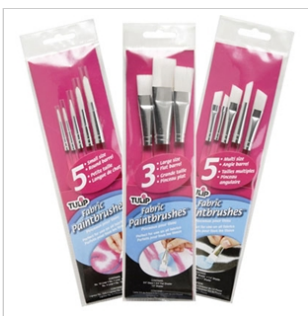
Tulip® Fabric Paintbrushes™