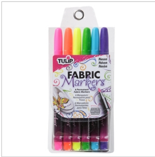
Fine Tip Neon 6 Pack (28975)