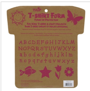
Tulip® T-shirt Form (26575)