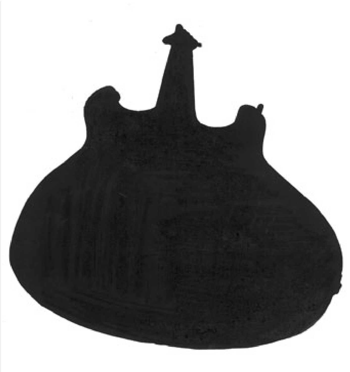
Radical Riffs T-shirt Pattern 1