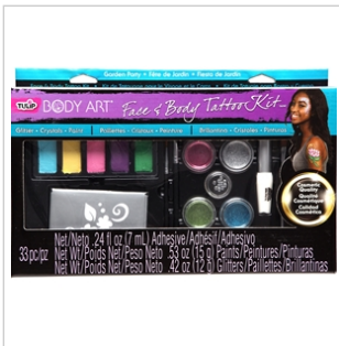
Tulip® Body Art® Kit Garden Party (32546)