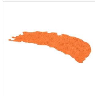
Mandarin Orange 1 oz. (15787)