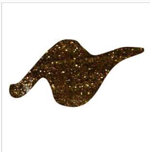
Gold 1.25 oz. (65088)