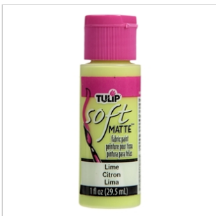
Lime 1 oz. (15797)