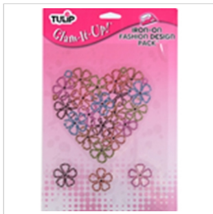
Large Flower Heart Pack (29158)