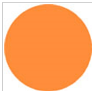
Neon Orange (26558)