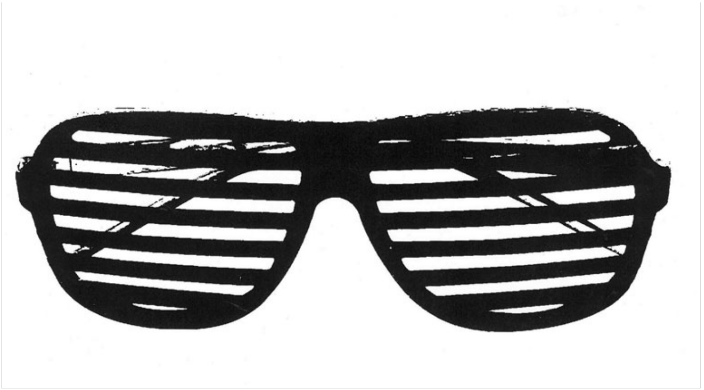
Bright Eyes T-shirt Pattern 1