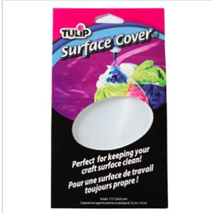
Tulip® Surface Cover™