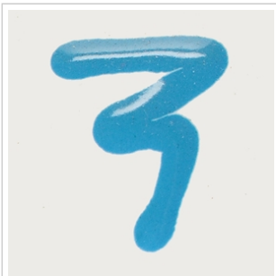
FD 275 Neon Blue (82546)