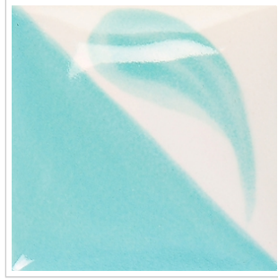
CN 151 Light Blue Spruce