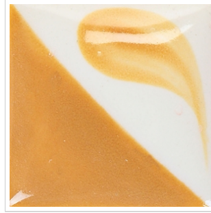
CN 312 Bright Ginger