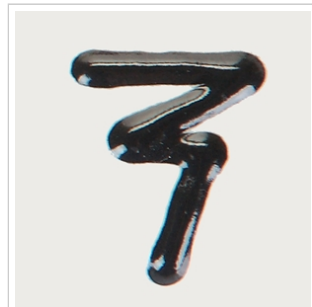
FD 254 Black Licorice (80304)