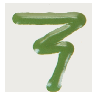
FD 271 French Kiwi (80312)