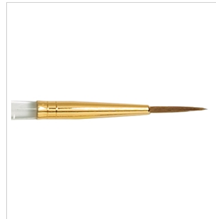
SB 802 No. 1 Liner (92452)