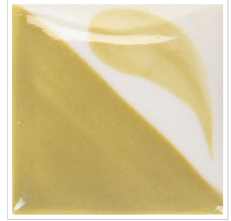
CN 332 Bright Olive