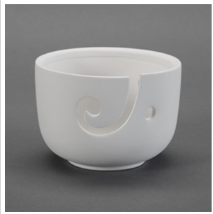
Yarn Bowl (32942)