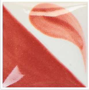
CN 063 Dark Salsa