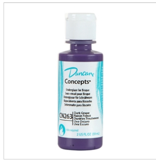
CN 263 Dark Grape 2oz (80478)