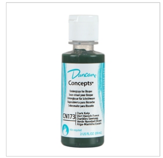
CN 173 Dark Kelp 2oz (98845)