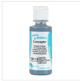
CN 113 Dark Delft 2oz (98841)