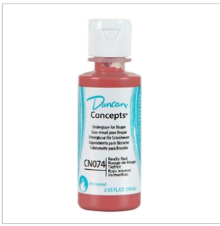
CN 074 Really Red 2 oz. (20582)