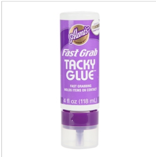
Aleene's® Always Ready Fast Grab Tacky Glue (33141)