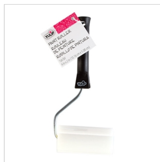
Tulip® Paint Roller (32359)