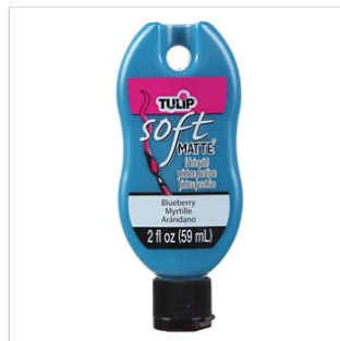
Tulip® Soft® Fabric Paint Home Decor Blueberry Matte (32318)