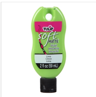
Tulip® Soft® Fabric Paint Home Decor Lime Matte (32313)