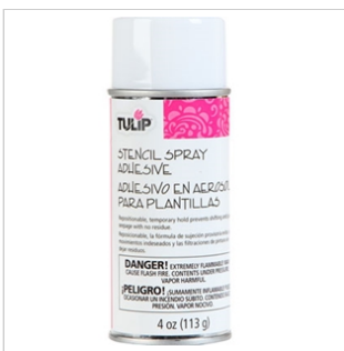
Tulip® Stencil Spray Adhesive (32357)