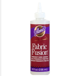
Aleene's® Fabric Fusion® Permanent Fabric Adhesive 8 fl. oz. (25042)