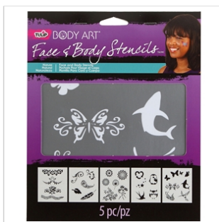
Tulip® Body Art® Stencils Nature (32690)