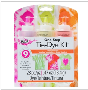
Tulip® One-Step Tie-Dye Kit® Tropical Twist (31667)