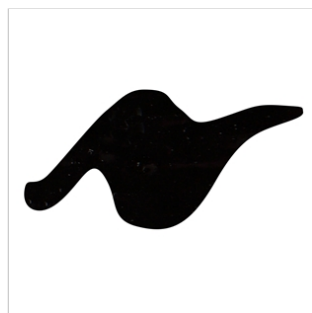
Black 1.25 oz. (65038)