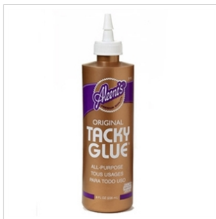
Aleene's® Original Tacky Glue® 8 oz. (15599)