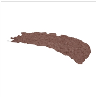
Chocolate 1 oz. (15800)