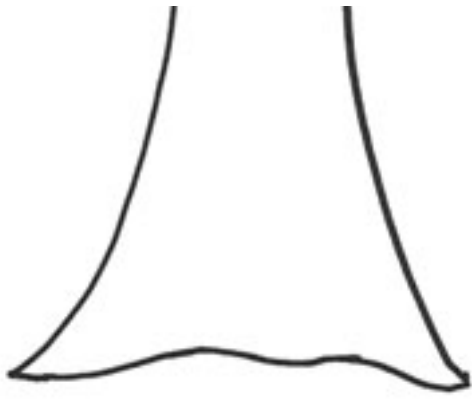
Spring Tree Tee Pattern 1