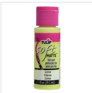
Lime 1 oz. (15797)