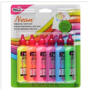
Neon 6 Pack (29027)