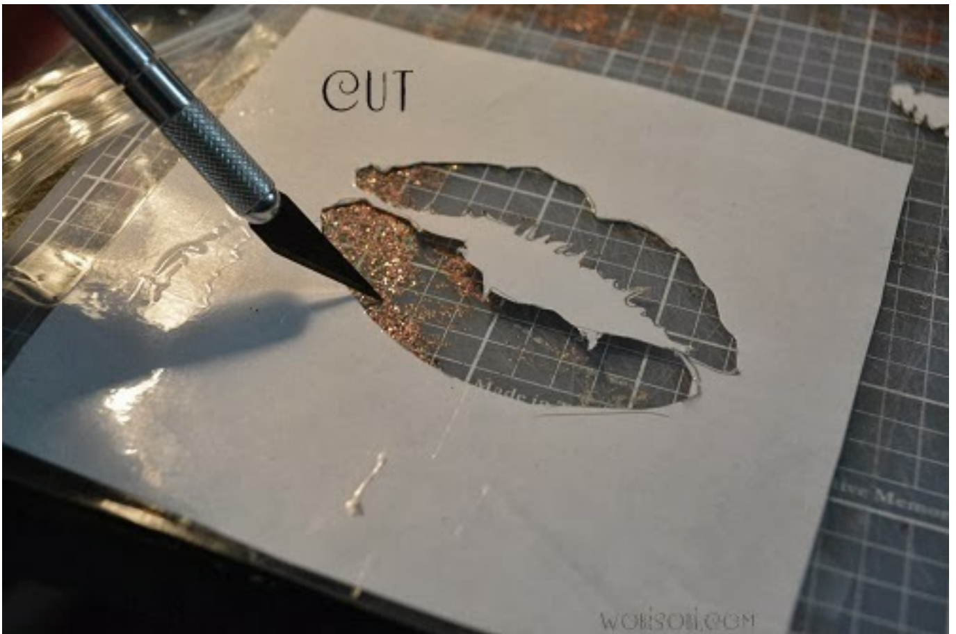
Cut it out using your x-acto knife