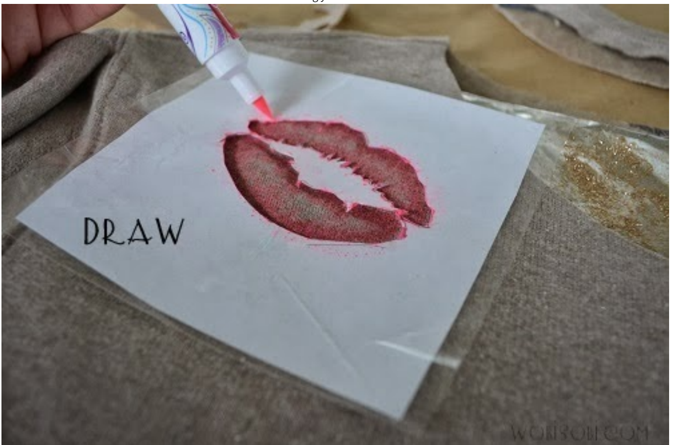
Place the stencil on your sweat shirt, using your Tulip Markers draw around the stencil, working from the outside edge toward the inside. Make the edges a little darker, that will give you a 3D effect.