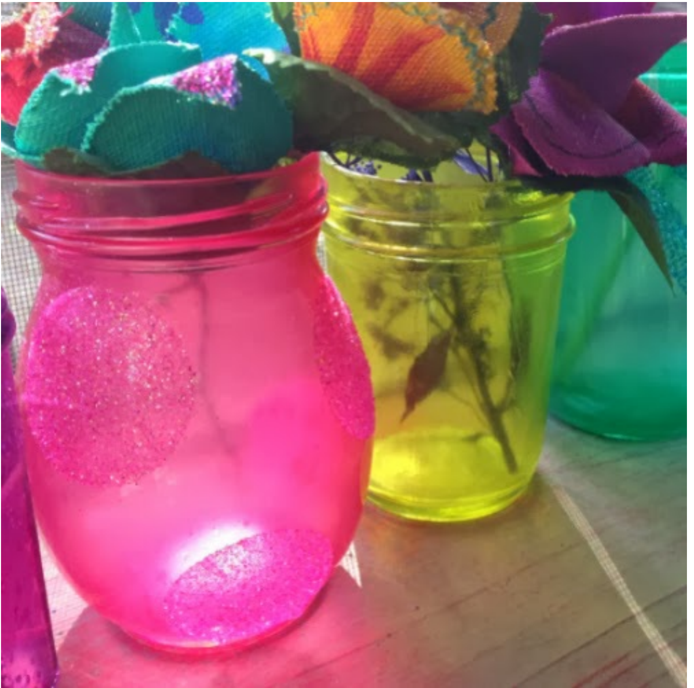
And there you have it! Aren't they pretty? I love the how the sun shines through them. You could also wrap the tops with wire and hang them!