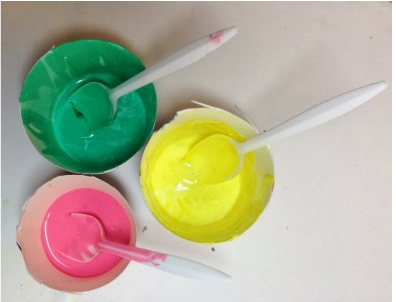
This is what they will look like. I was worried, I was like, "Pastels! Nooo!" But hang on, the liquid dries clear, creating the stained glass look.