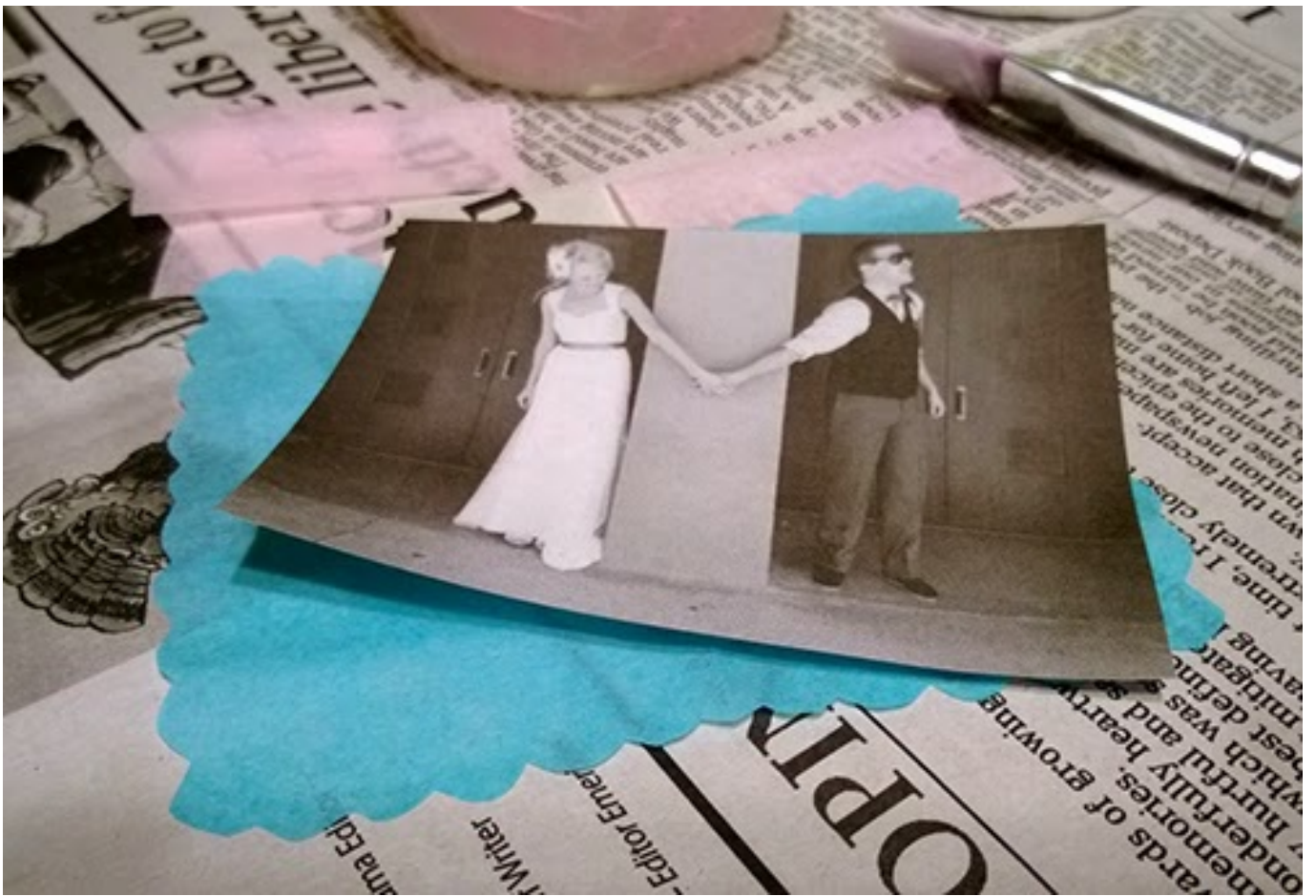
...and collaged on a photo from my wedding day!