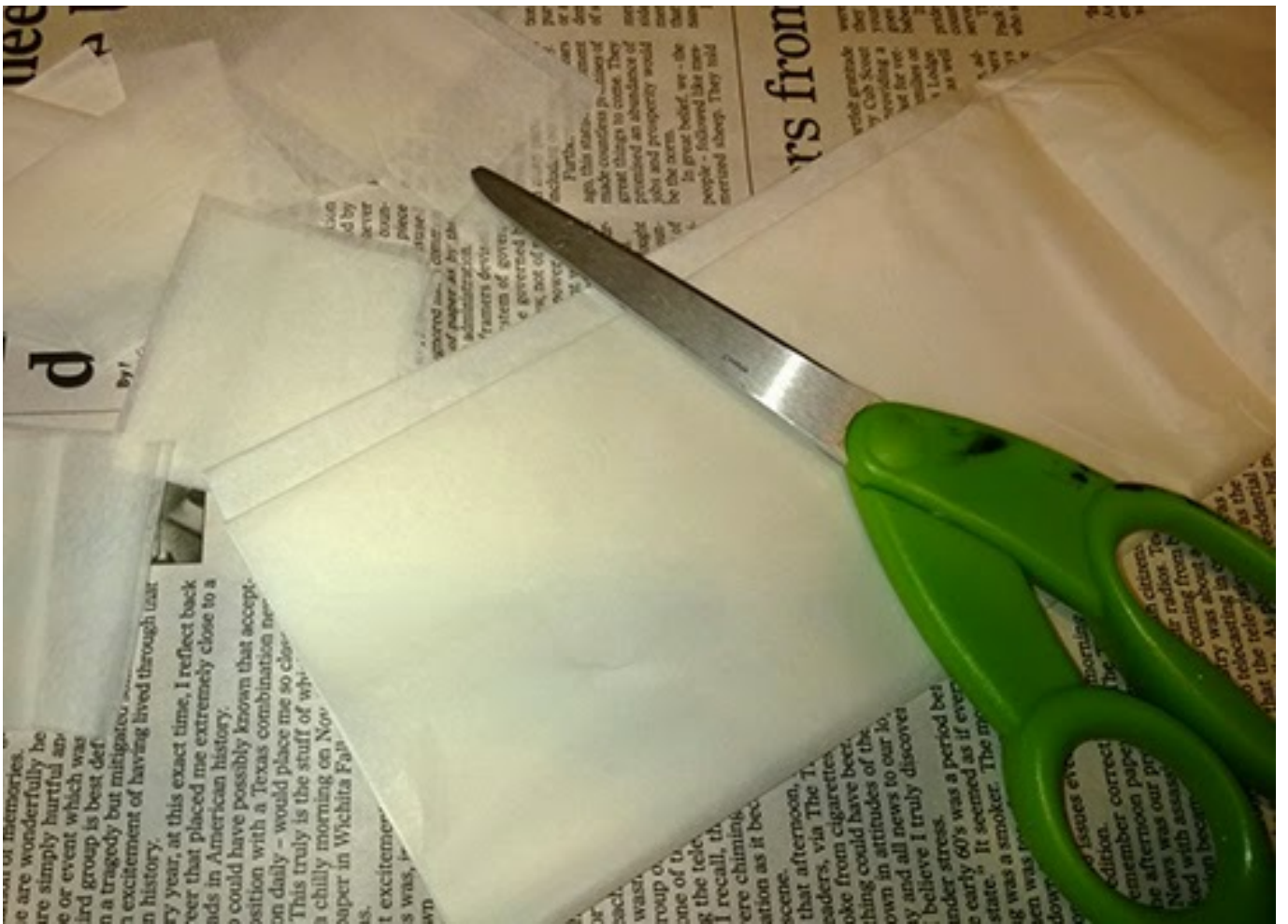
Cut up small strips of paper from your stack of tissue paper.