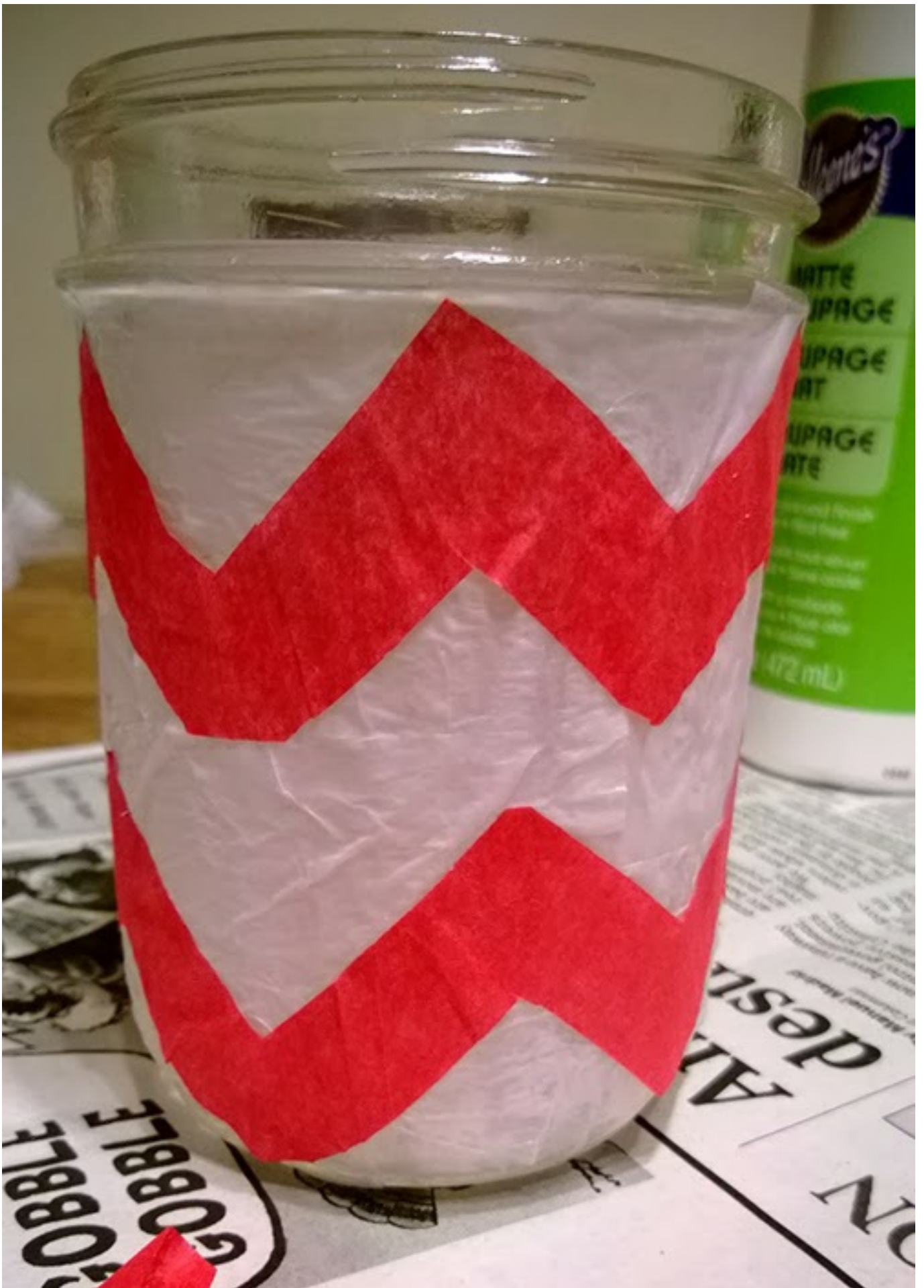
I cut up 1" strips of the red tissue paper and arranged them in a chevron fashion. Don't worry, any overlapping areas of the tissue paper won't show much when you've collaged them on!