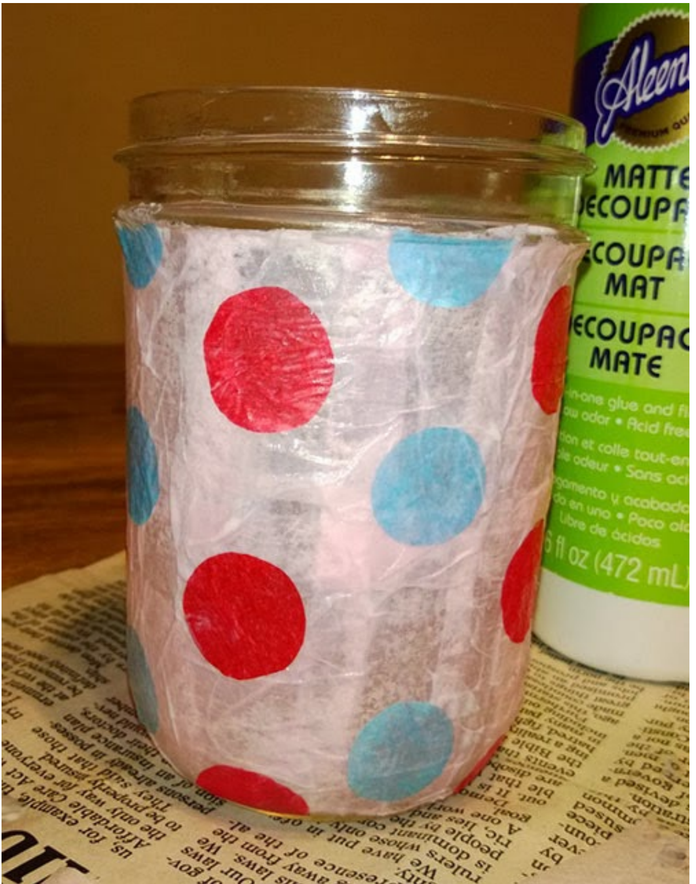
For another jar, I cut out polka dots with the tissue paper.