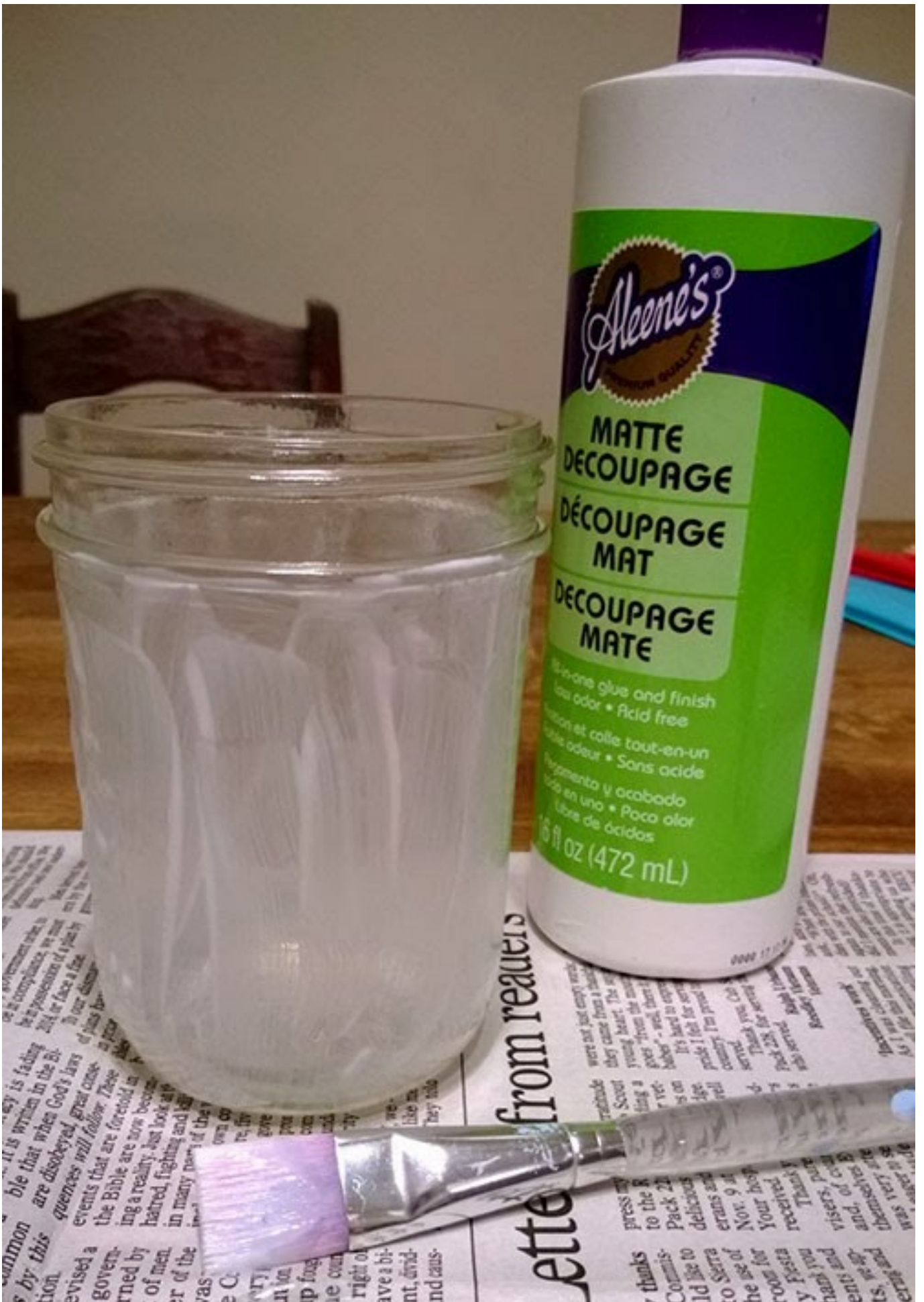
Now add a coat of your Aleene's Decoupage to your jar using your paintbrush.