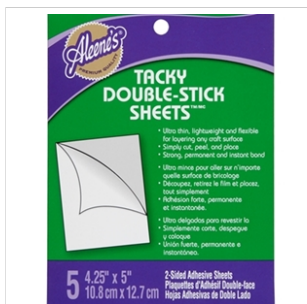
Aleene's® Tacky Double-Stick Sheets™ (29133)