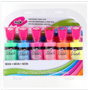
4 oz. Neon 6 Pack (31419)