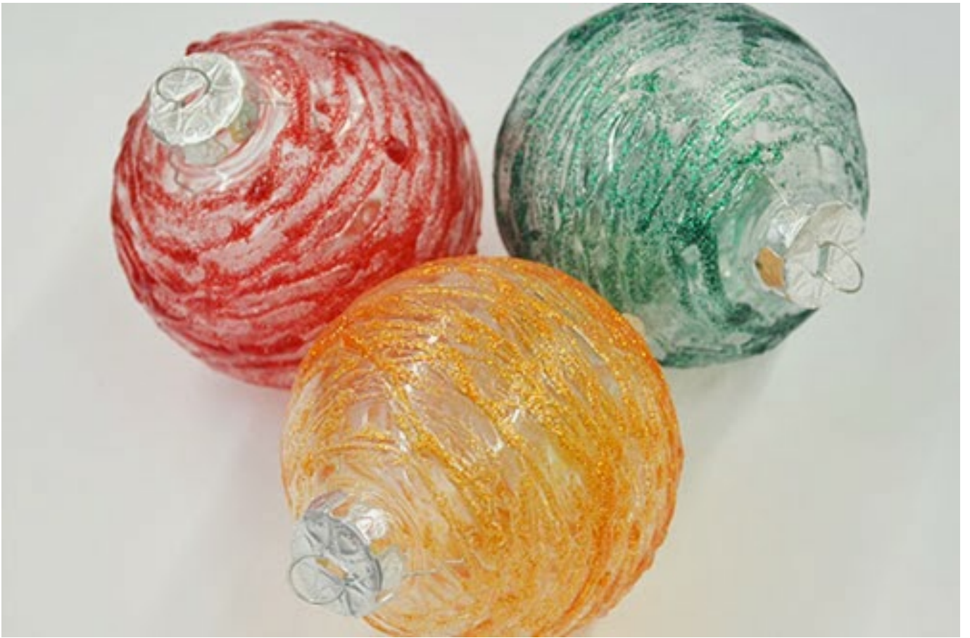
And they turned out so pretty and fun!