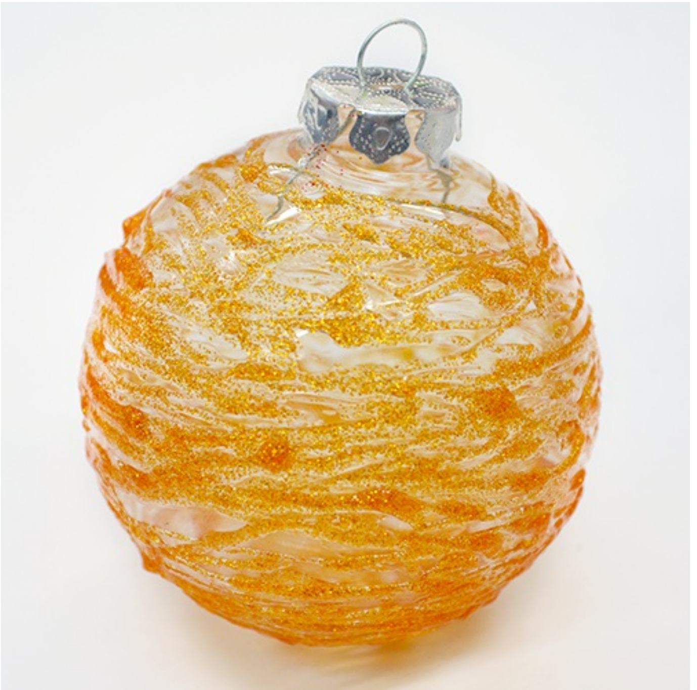
The gold one turned out to be my favorite.