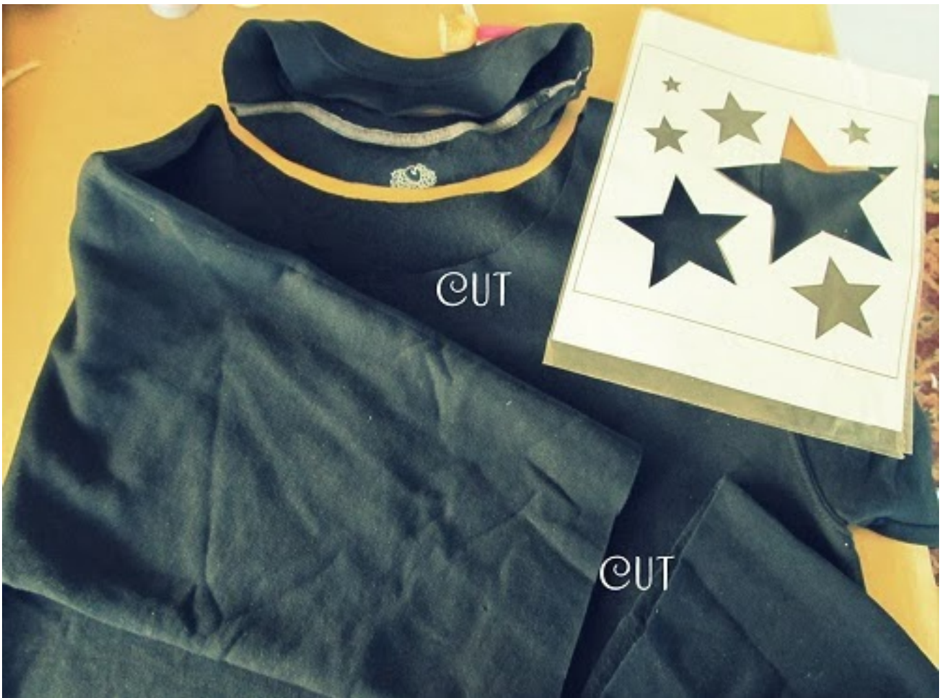
Cut your collar off to make your sweatshirt the off the shoulder look and cut the sleeves the length you want.