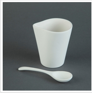
Mug with Stirrer (33428)