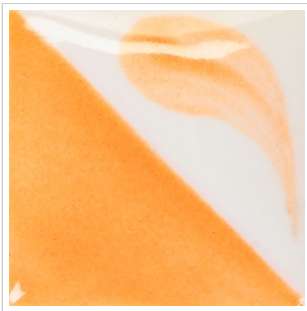
CN 042 Bright Papaya