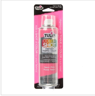
ColorShot Pink (33596)