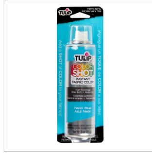
ColorShot Neon Blue (33602)