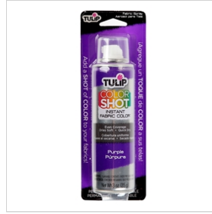
ColorShot Purple (33604)