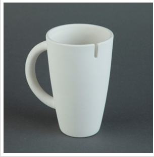
Tea Bag Mug (33427)