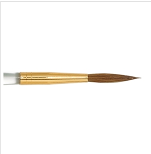
SB 803 No. 4 Liner (92453)