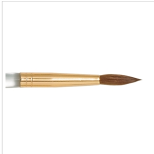
SB 806 No. 6 Round (92456)