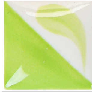
CN 505 Neon Green