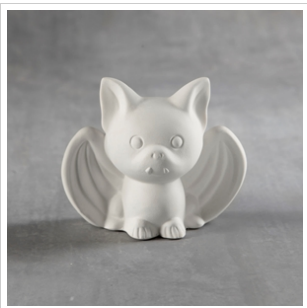
Tiny Tot Fang the Bat (32853)