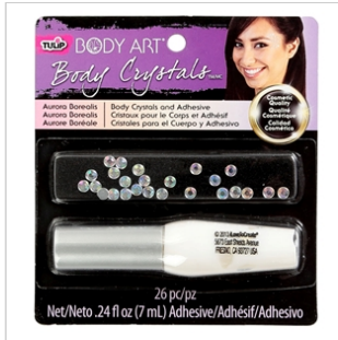
Tulip® Body Art® Crystals & Adhesive Aurora Borealis (32676)