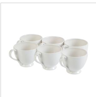
Tea Mug - Set of Six (34340)