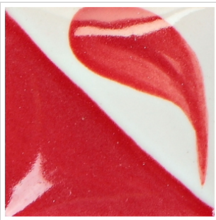
CN 074 Really Red