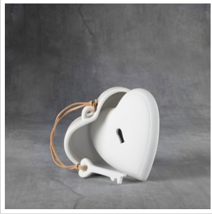
One Lock One Key Box (37096)