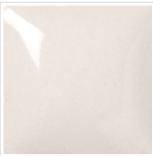
Duncan® Pure Brilliance® Clear Glaze