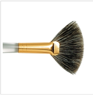
SB 807 No. 6 Fan Glaze (92457)