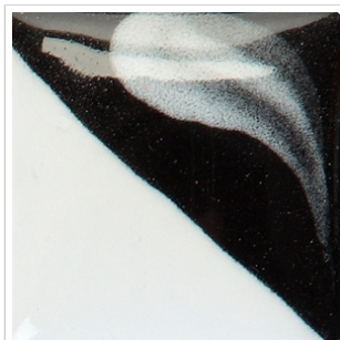
CN 244 Really White