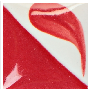
CN 074 Really Red