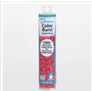
CR 882 Red Eruption (34120)