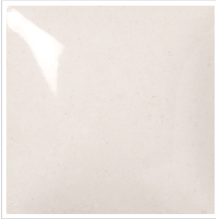
Duncan® Pure Brilliance® Clear Glaze (26398)