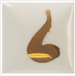
OG 805 Premium Gold (97509)