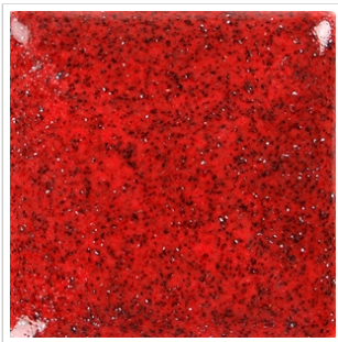
SH 508 Ruby