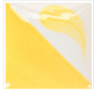
CN 021 Light Saffron