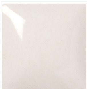
Duncan® Pure Brilliance® Clear Glaze