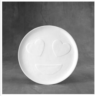
Love Plate (37098)