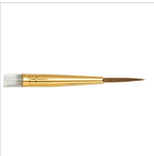
SB 802 No. 1 Liner (92452)