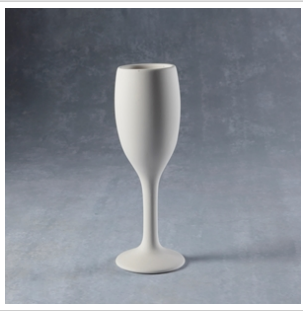
Champagne Flute (37201)