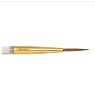
SB 802 No. 1 Liner (92452)