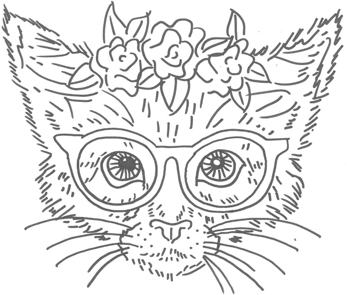
Hipster Cat Pattern