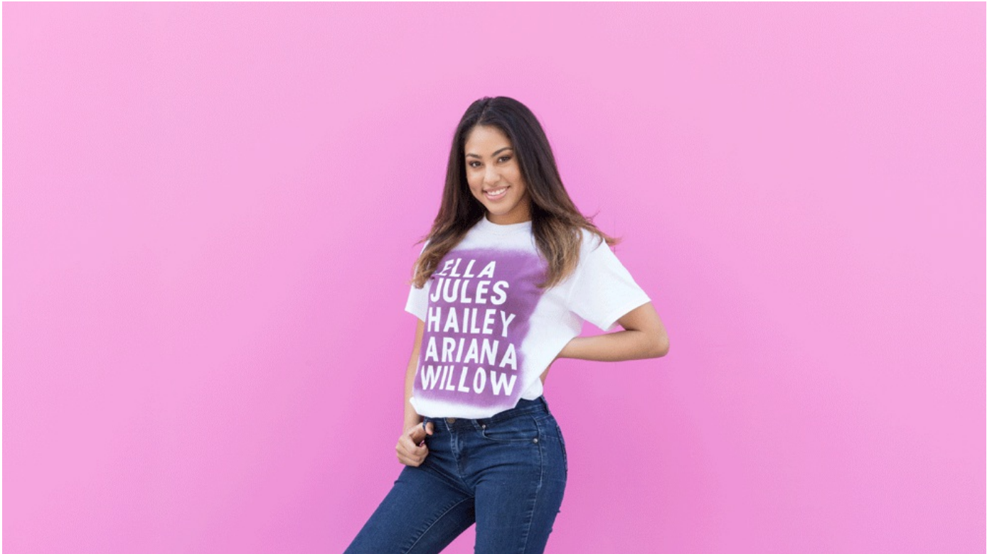
Be sure that your camera is ready, because trust us, you're going to want to take a ton of pictures in these awesome shirts!