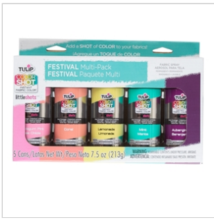
ColorShot 5 Pack Festival (35029)