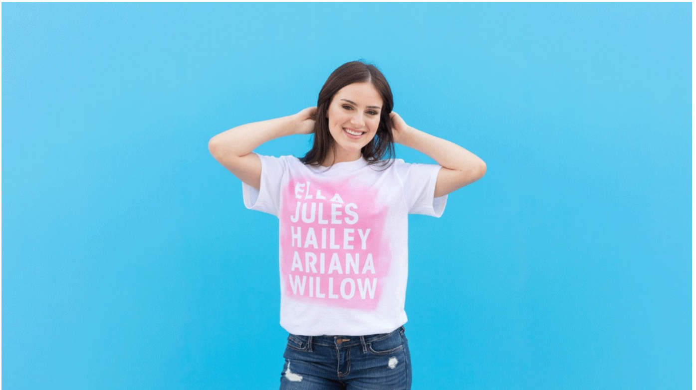
Now your shirts are ready to rock! Don't forget, everyone gets to wear their own signature color.