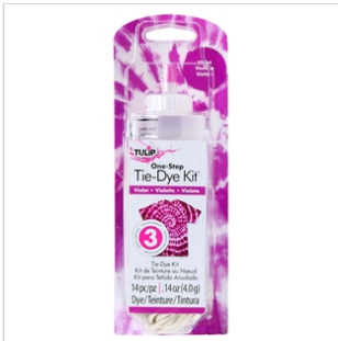
Tulip® One-Step Tie-Dye Kit® Violet (31681)