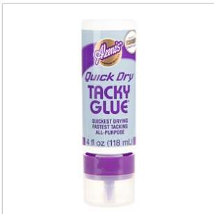
Aleene's® Always Ready Quick Dry Tacky Glue (33147)