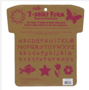
Tulip® T-shirt Form (26575)