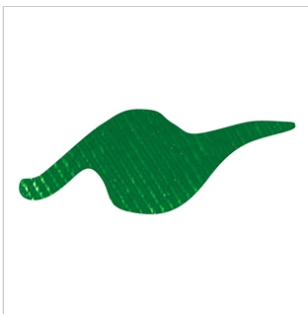
Shamrock Green (54215)