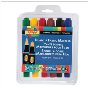
Dual Tip Primary 6 Pack (24248)