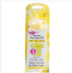
Tulip® One-Step Tie-Dye Kit® Yellow (21549)