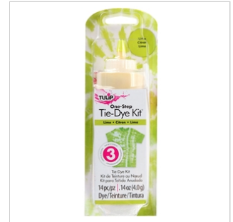
Tulip® One-Step Tie-Dye Kit® Lime (27861)