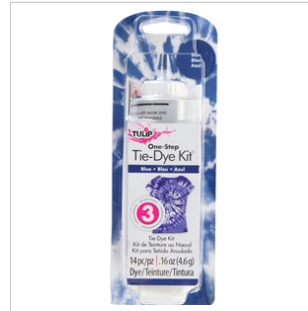
Tulip® One-Step Tie-Dye Kit® Blue (21547)