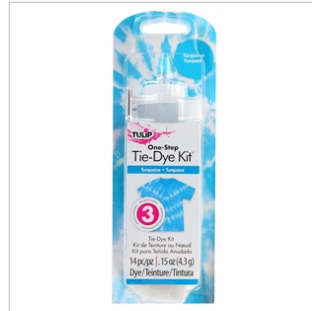
Tulip® One-Step Tie-Dye Kit® Turquoise (21548)