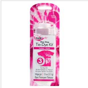
Tulip® One-Step Tie-Dye Kit® Fuchsia (21544)