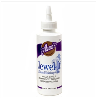
Aleene's® Jewel-It™ Embellishing Glue