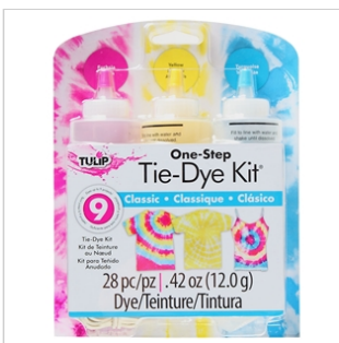
Tulip® One-Step Tie-Dye Kit® Classic (31668)