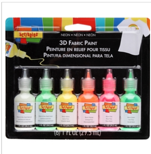
Neon 3D Paint 6 Pack (26514)