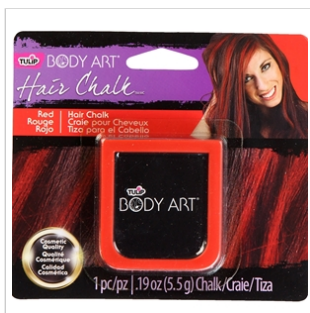
Tulip® Body Art® Hair Chalk Red (32425)